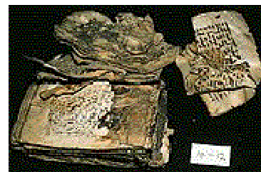
Yemeni Koran Fragments, as they were found in 1972.